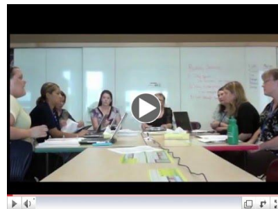
2nd Grade Team Meeting

Click the videos below to see short clips from two of our team meetings: