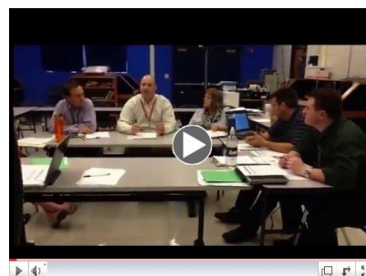
Middle School Team Meeting